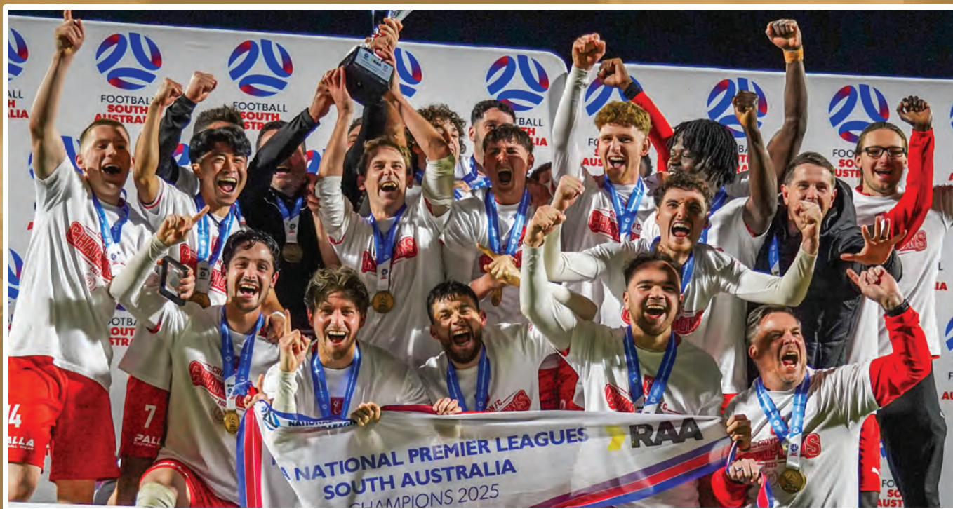
RAA Men's NPLSA Champions Croydon FC