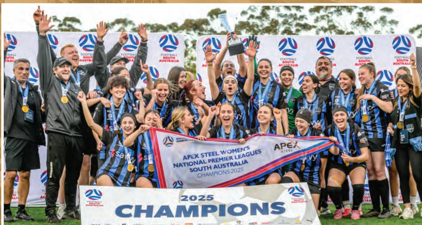
Apex Steel Women's NPLSA Champions Adelaide Comets